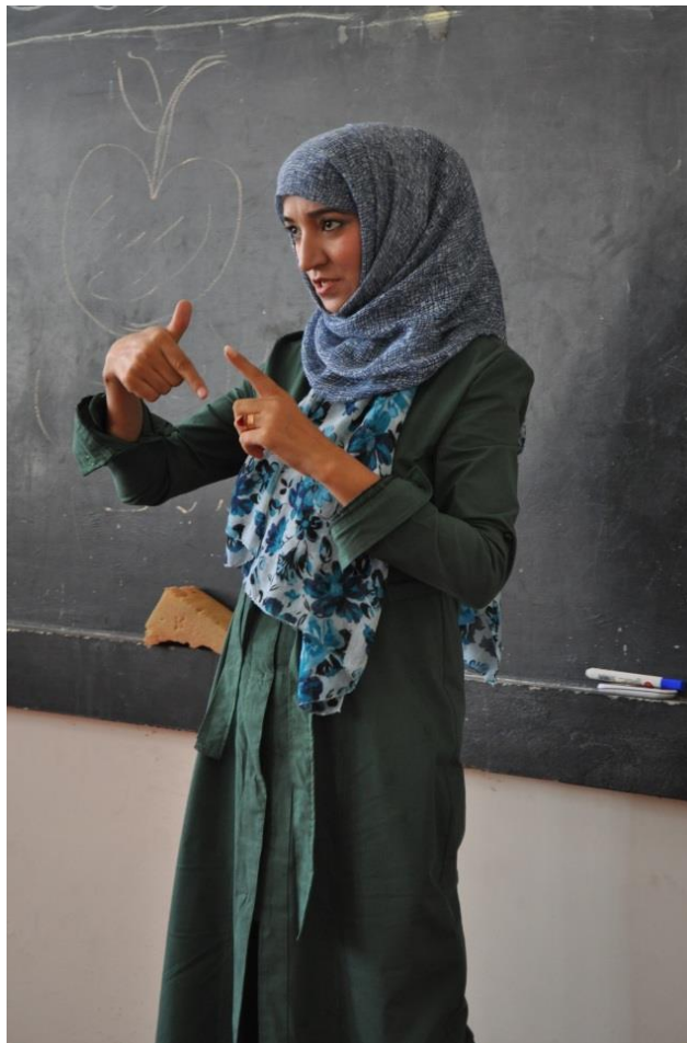
Children painting and decorating the school wall teachers using Sign language during activities for the children in the School for the Deaf.